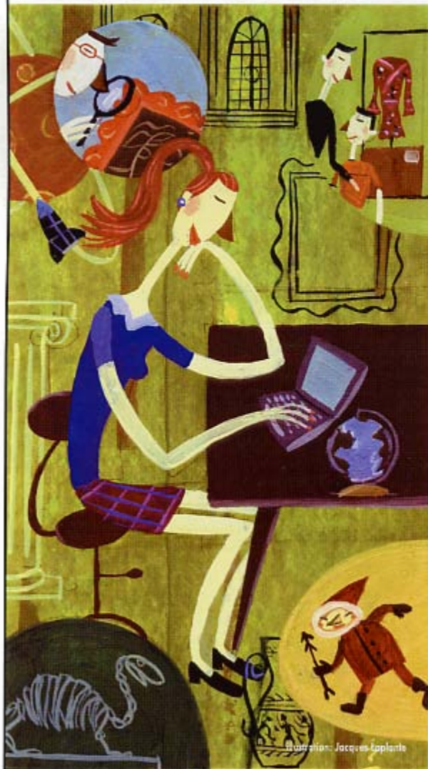
Illustration: Jacques Laplante